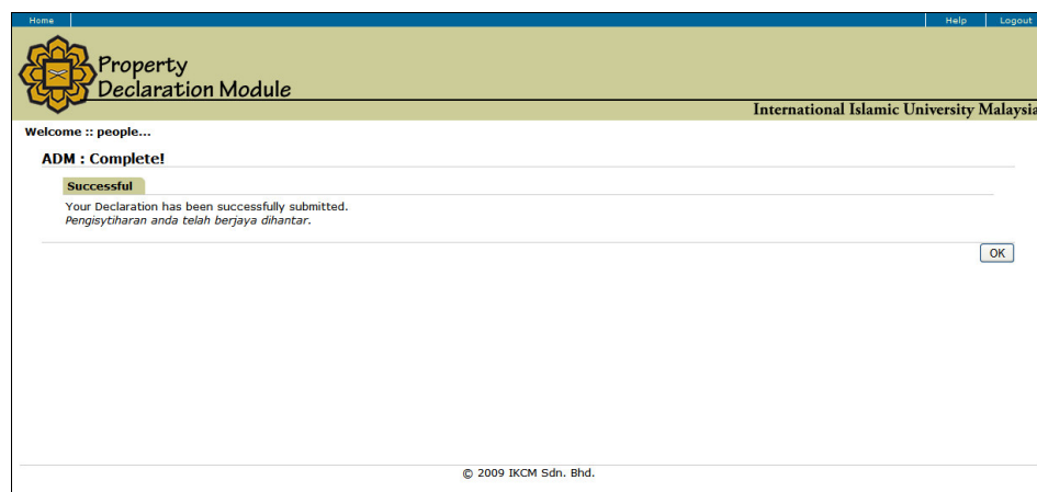
Figure 4-Form D-8: Asset Declaration – Successful Message Page