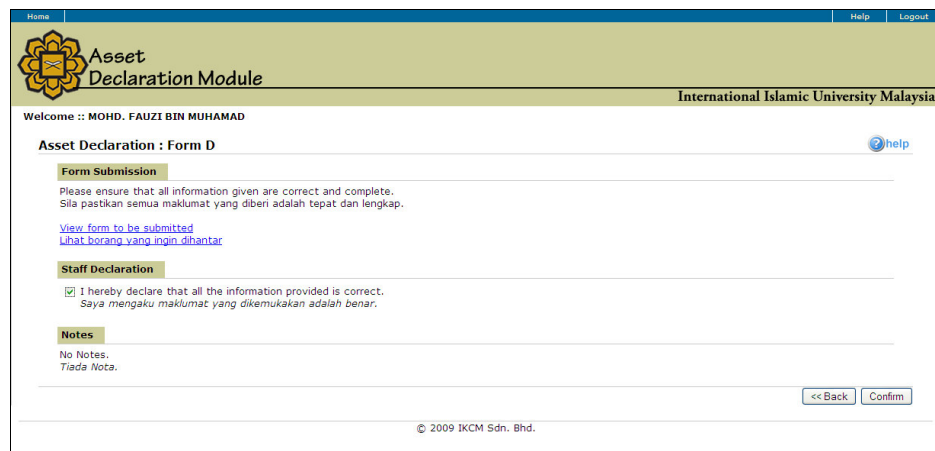
Figure 4-Form D-7: Asset Declaration – Form Submission Page